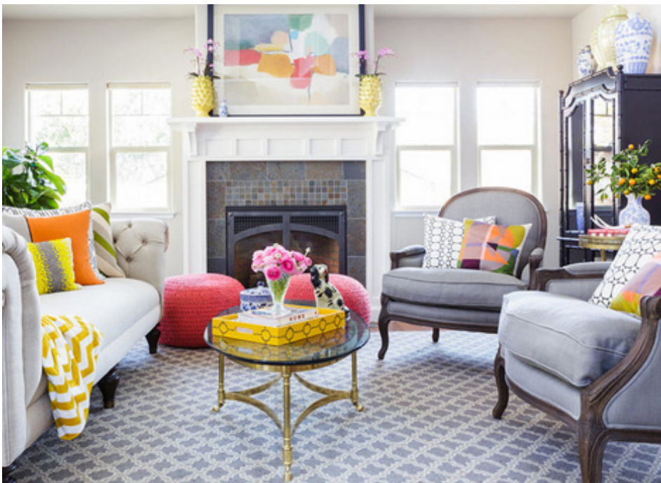
Photo credit: Houzz - Walnut Creek Bungalow living room - San-Francisco